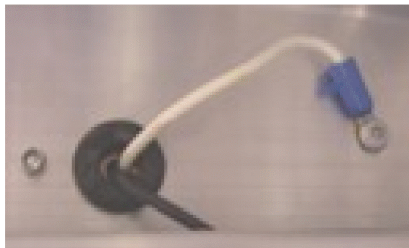
Lights are independently grounded.