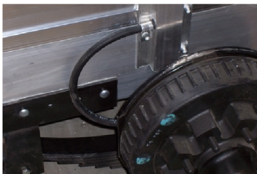
Axle wiring is completely covered.