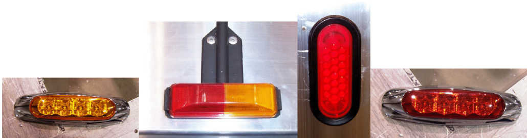
Standard LED Lighting System