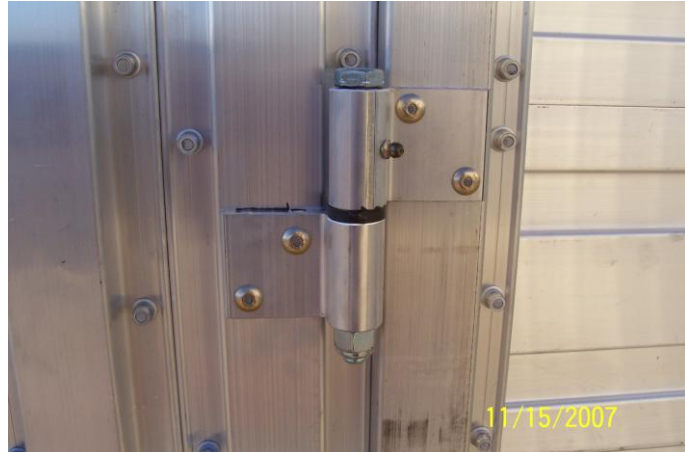
*Extruded Hinges with grease zerks