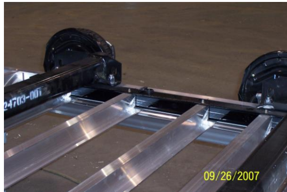
*Powder coated Torsion Mount Subframe