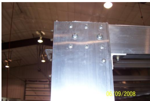
*Riveted Tail frame corners