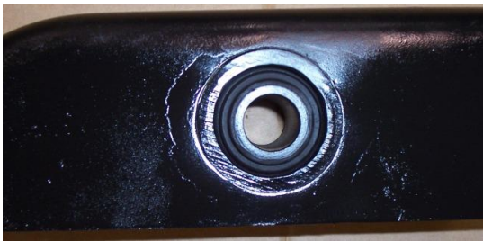
*Rubber bushed equalizers